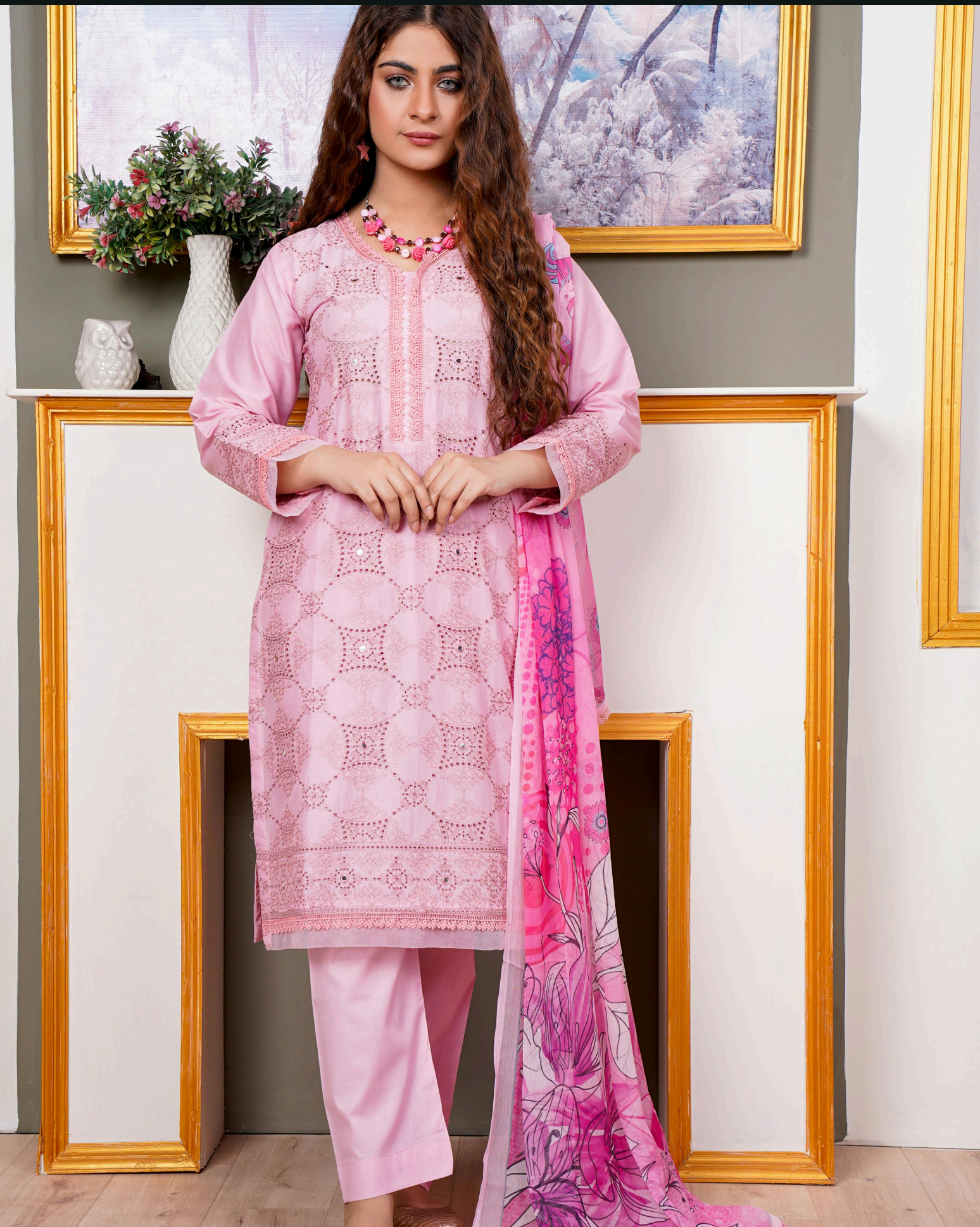
Suit Dupatta Salwar 3pcs